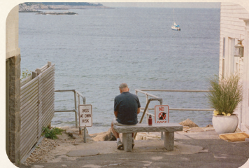
Labyrinth Through Glass