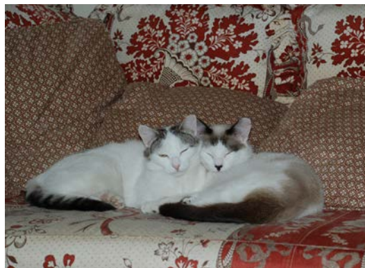
4. Bunny and Vinnie