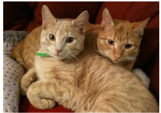
5. Benson and MacGruber