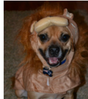
Dexter (Colleen Woods, Financial Aid)